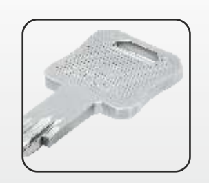
PATENTED KEY PROFILE AND INNOVATIVE DESIGN against illegal key duplication.