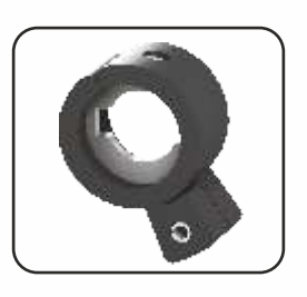
PATENTED ANTI-BREAKING CAM for higher breaking resistance.